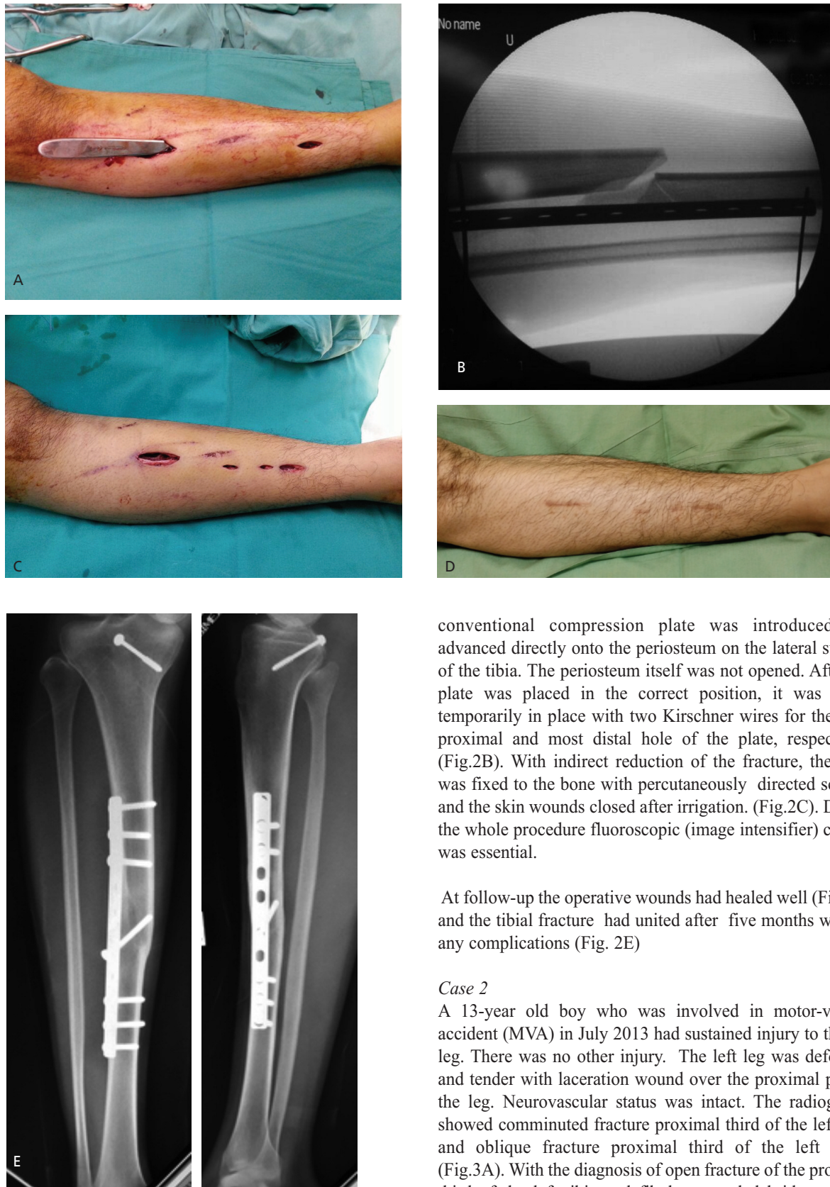
Fig. 2: A. Subcutaneous tunnel created -using bone lever. B. The plate being held temporarily in place with two Kirschner wires. C. Final operative wound with MIPO technique. D. The operative wound healed well. E. The tibial fracture had united well.

conventional compression plate was introduced and advanced directly onto the periosteum on the lateral surface of the tibia. The periosteum itself was not opened. After the plate was placed in the correct position, it was held temporarily in place with two Kirschner wires for the most proximal and most distal hole of the plate, respectively (Fig.2B). With indirect reduction of the fracture, the plate was fixed to the bone with percutaneously directed screws, and the skin wounds closed after irrigation. (Fig.2C). During the whole procedure fluoroscopic (image intensifier) control was essential.