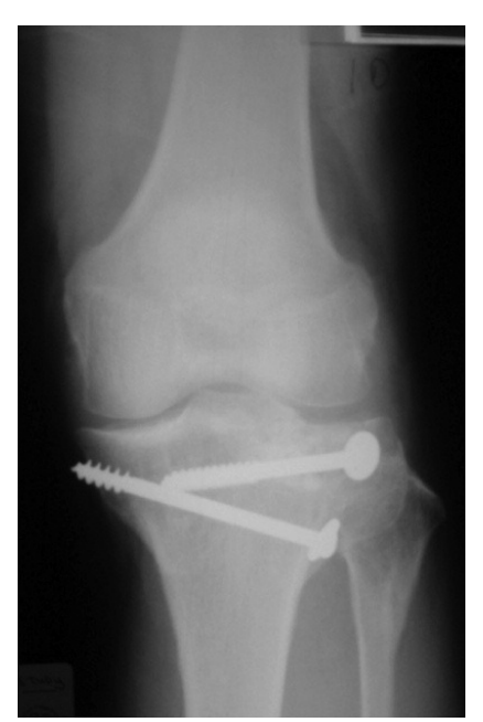
Fig. 2b: Final position after healing.