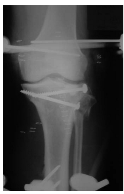
Fig. 2a: Anteroposterior radiographic view of bicondylar plateau fracture after transarticular external fixation and limited internal fixation.