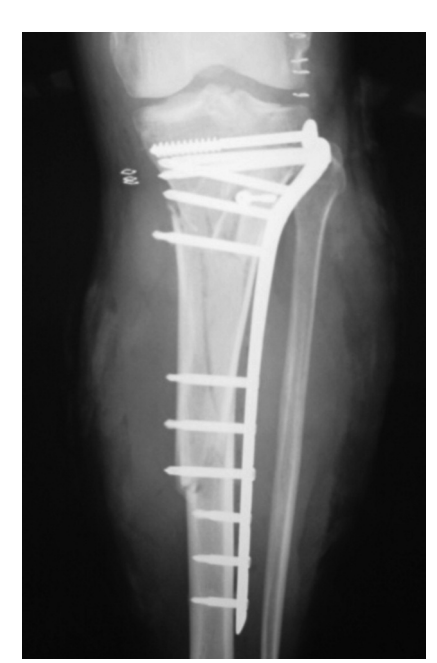
Fig. 1: Position after internal fixation with Less Invasive Stabilization System (LISS) plate.