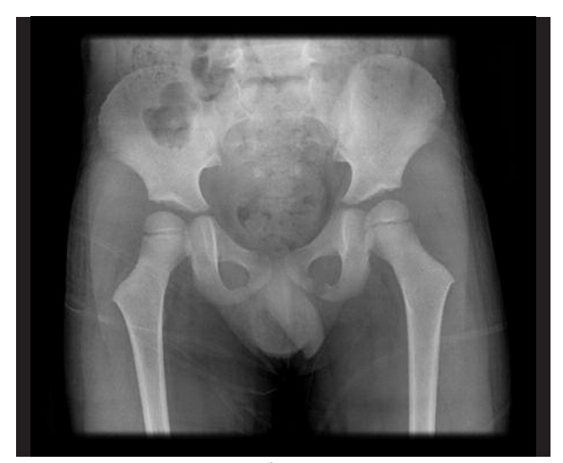
Fig. 1a: Plain AP radiograph of the hips.