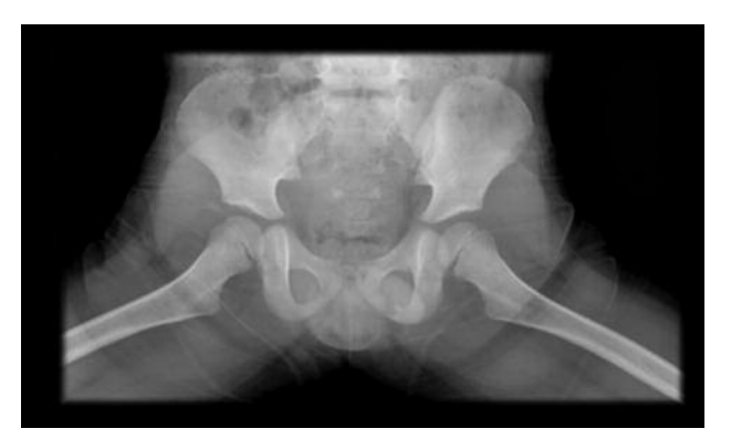
Fig. 1b: Plain frogview radiograph of the hips.

As blood tests are not specific enough, early imaging is essential for accurate diagnosis. Plain radiograph are usually normal. Although ultrasound is a useful first line test to first