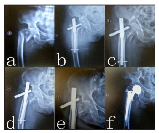
Figure 2. Intertrochanteric fracture after surgery spiral blade cutting to cut out above and exit, internal fixation failure. A. Preoperative X-ray film. B. Postoperative X-ray film. C. One month after surgery spiral blade cutting to cut out above and exit. D. Tow month after surgery spiral blade cutting exit aggravate. E. Three months after surgery spiral blade has completely cut out of the femoral head. F. After artificial femoral head replacement.