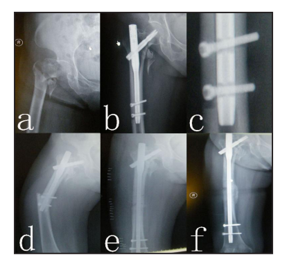
Figure 3. Re-fracture after intertrochanteric fracture surgery. A. Preoperative X-ray film. B. Postoperative X-ray film. C. Due to the remote locking difficulty, repeatedly drilling induced lateral cortical defect during surgery. D. Three months after surgery fracture occurs again when getting out of bed. E. Longer PFNA internal fixation. F. Three months after longer PFNA internal fixation, the inside has been obvious porosis formation.

Genetics and Molecular Research 13 (3): 5949-5956 (2014)